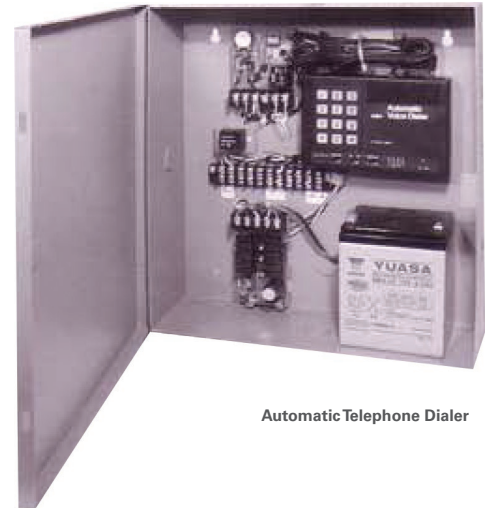
Automatic Telephone Dialer